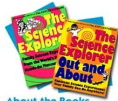
About the Books...

This and dozens of other cool activities are included in the Exploratorium's Science Explorer books, available for purchase from our online store .